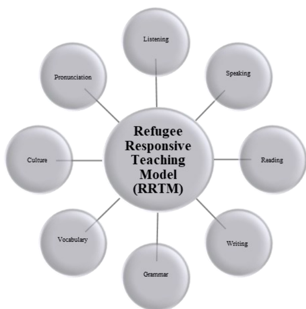
Figure 2. RRTM and EFL Skills/Areas

The proposed RRTM focuses on ten specific refugee teaching competencies (Fig.1). The first competency is functioning refugee social topics in EFL classes. EFL teachers should be able to use